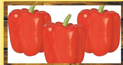
Red Bell Peppers