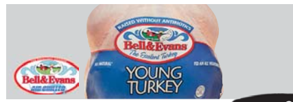
Bell & Evans Fresh Whole Turkey