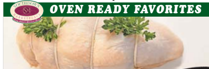
Boneless Turkey Breast With Or Without Seasoning