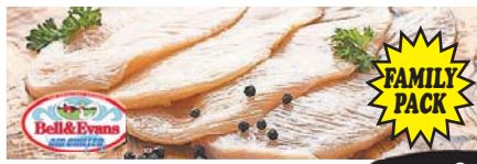
Bell & Evans Thin Sliced Chicken Cutlets