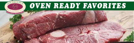
USA Fresh Leg Of Lamb Roasts Or Steaks