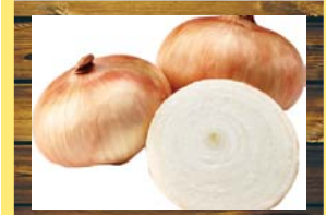
Sweet Vidalia Onions