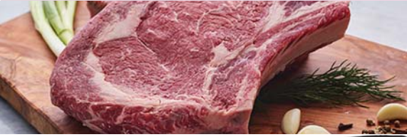
USDA Platinum First Cut Bone In Rib Eye Steak

Happy Thanksgiving From Your Friends At Southdown Marketplace