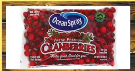
Ocean Spray Cranberries