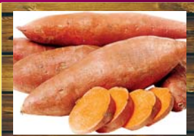
USA #1 Yams