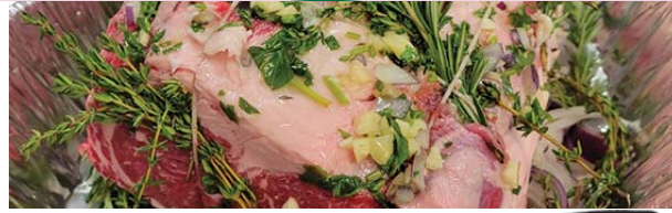
USDA Platinum Bone in Rib Roast