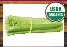
Organic Celery Hearts