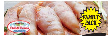
Bell & Evans Fresh Chicken Tenders