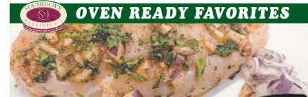
Italian Marinated Turkey London Broil