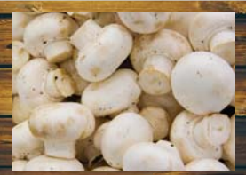
Snow White Mushrooms