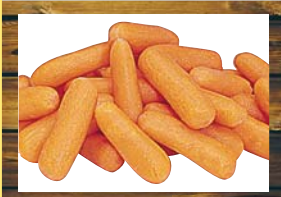
Baby Peeled Carrots