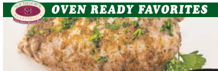
Split Bone In Turkey Breast With Olive Oil, Salt, Pepper, Garlic, & Rosemary