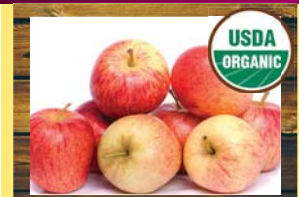
Organic Gala Apples