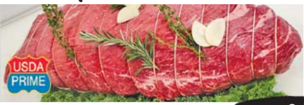
USDA Prime Beef Eye Round Roast