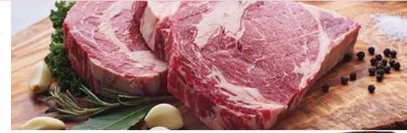
USDA Platinum Boneless Rib Eye Steak