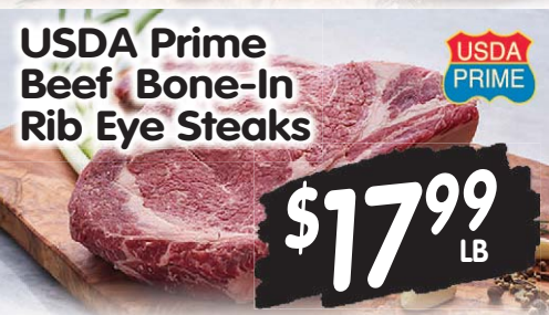
USDA Prime Beef Bone-In Rib Eye Steaks