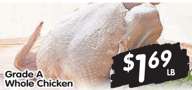
Grade A Whole Chicken