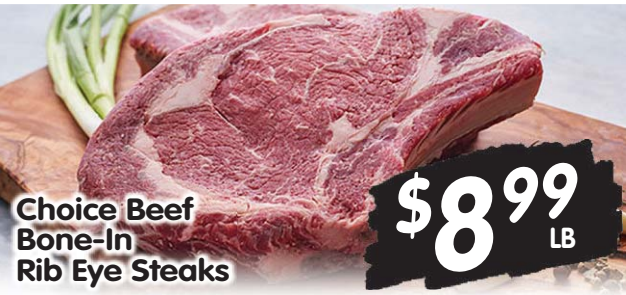
Choice Beef Bone-In Rib Eye Steaks