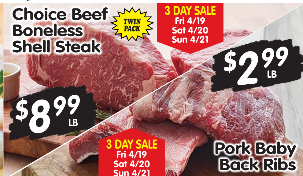
Choice Beef Boneless Shell Steak