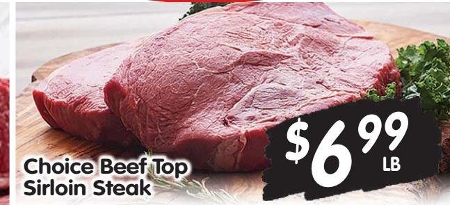
Choice Beef Top Sirloin Steak