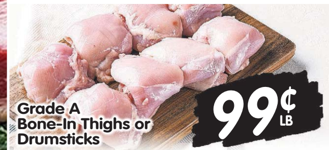
Grade A Bone-In Thighs or Drumsticks