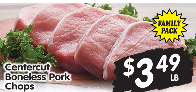
Centercut Boneless Pork Chops