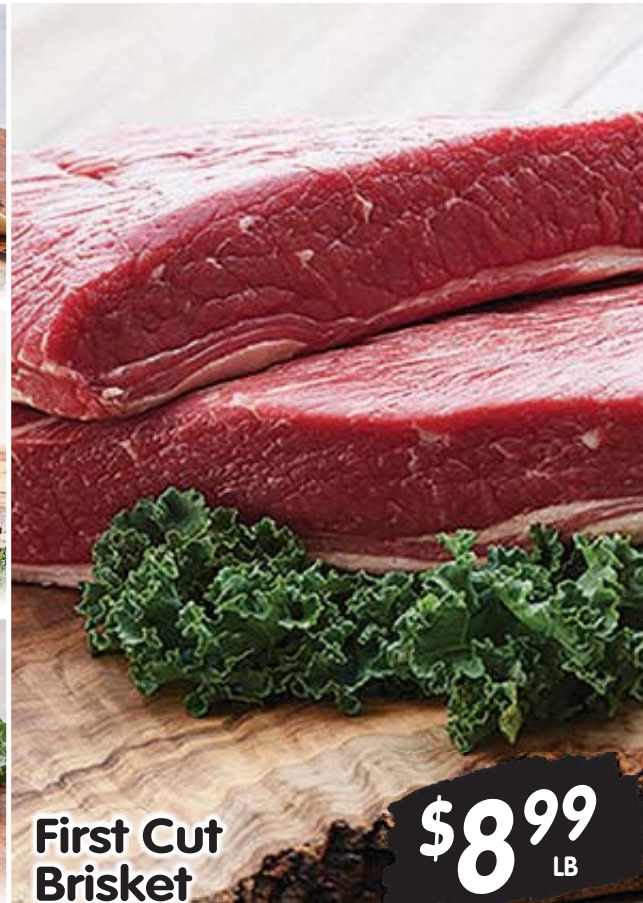
First Cut Brisket