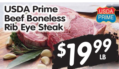
USDA Prime Beef Boneless Rib Eye Steak