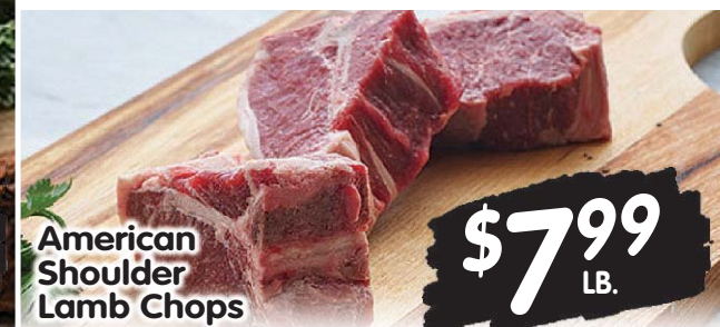
American Shoulder Lamb Chops